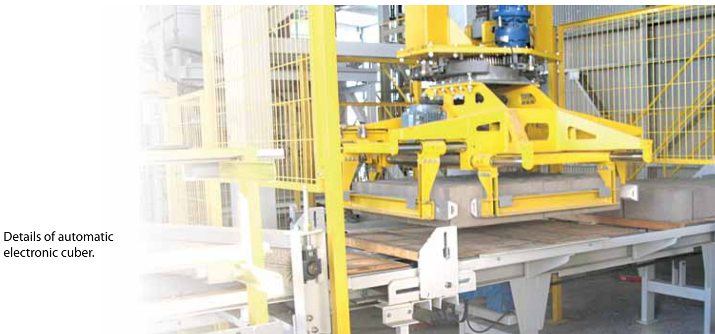
Details of automatic electronic cuber.