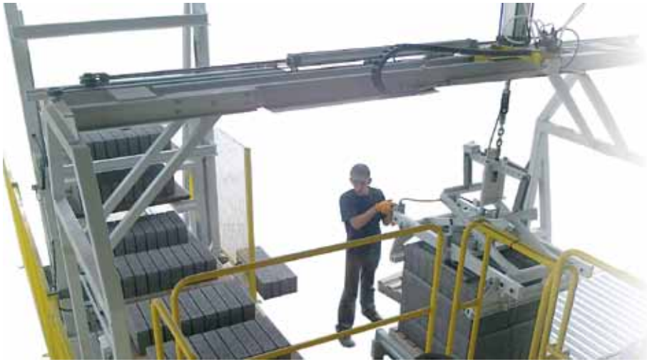
Details of pneumatic clamp for manual cubing.